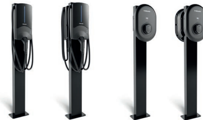
Webasto Stand Slim Solo & Duo