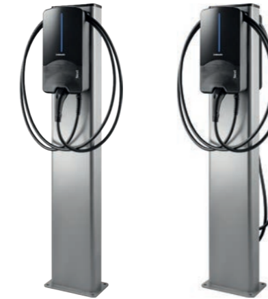
Webasto Stand Solo & Duo